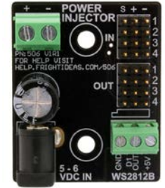
Four Channel Version (FlexMax / Other)