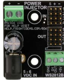
Four Channel Version (FlexMax / Other)