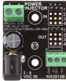
Single Channel Version (For EscapeKeeper)