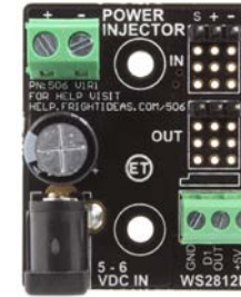
Single Channel Version (For EscapeKeeper)